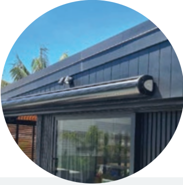
FACE FIX INSTALLATION