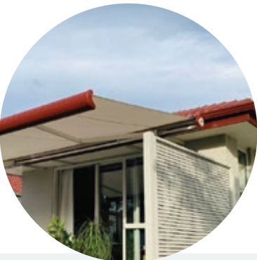
CUSTOM POWDER COAT COLOUR OPTIONS