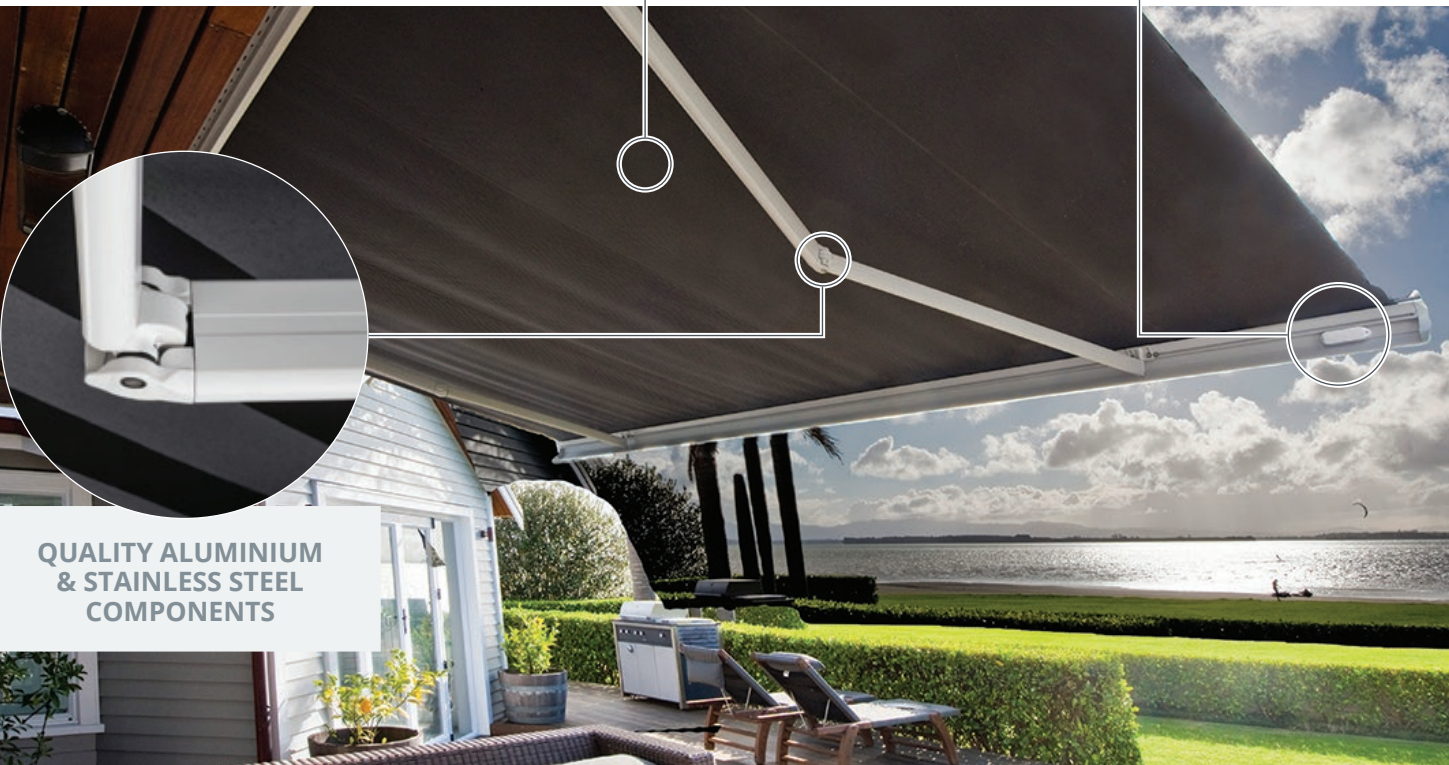
QUALITY ALUMINIUM & STAINLESS STEEL COMPONENTS