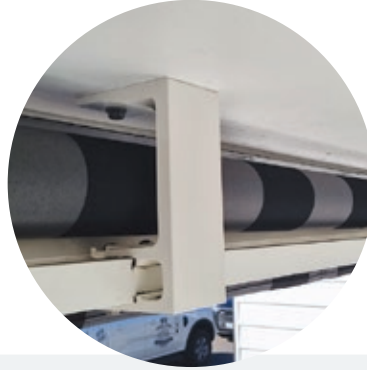
UNDER SOFFIT INSTALLATION