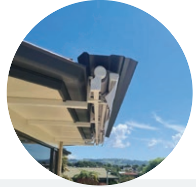
POWDER COATED ALUMINIUM HOOD