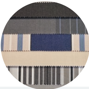
SOLID OR STRIPED FABRIC