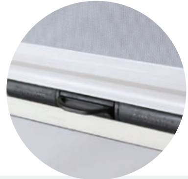
CENTRAL LOCK RELEASE SYSTEM. NO LATCHES TO TRIP ON