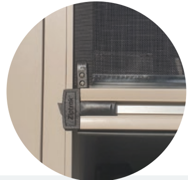
BOTTOM BAR WITH WEATHER STRIP AND LOCKS