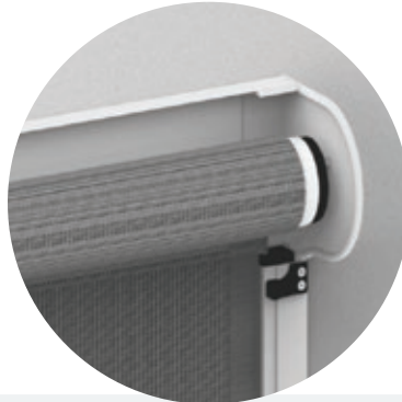
HALF EXTRUDED PELMET OPTION