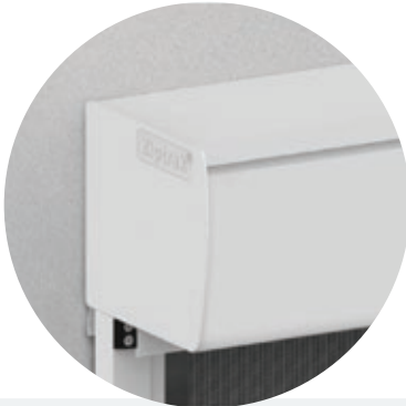
STREAMLINED PELMET WITH BRUSH INSERTS