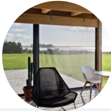
SIMPLE OPERATION WITH A SMOOTH & LIGHTWEIGHT GUIDED TRACK. NO CRANK HANDLE