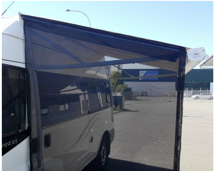
End wall with ridge pole - mesh

Front walls are available for wind and sun protection and are fitted into the awning track which is incorporated into every Shademaker Awning.